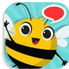
Articulation Station Comprehensive Speech Therapy