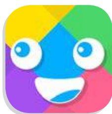
Otsimo Autism Games & Social Stories

This Touch and Learn Emotions app was made to help kids read body language and understand emotions by looking at gorgeous pictures and figuring out which person is expressing a given emotion.