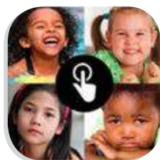
Touch and Learn - Emotions Education